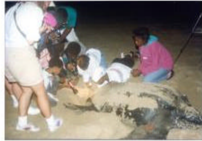
Sea Turtle Watching at Grande Anse Beach