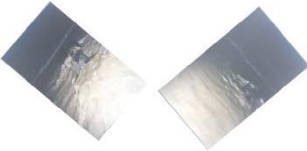
Leatherback Turtle Returning to the Ocean after Nesting