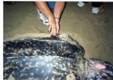
Tagging a Leatherback Turtle