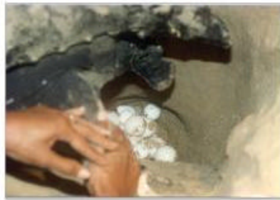
Egg Laying and Counting