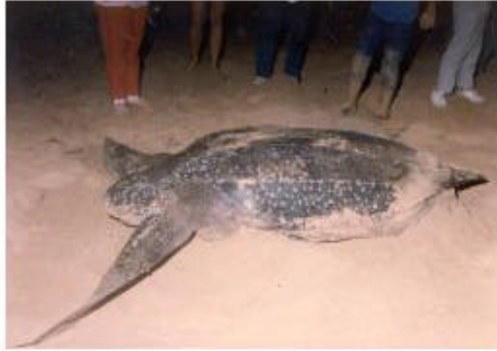
Leatherback Turtle Disguising its Nest