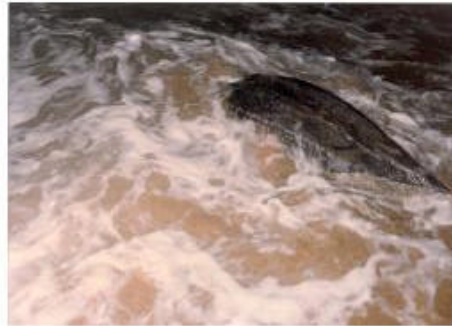
Leatherback Turtle Heading out to the Ocean after Nesting